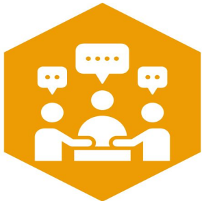
Peer Assisted Learning